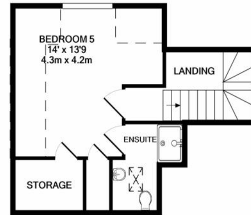
2ND FLOOR APPROX. FLOOR AREA 321 SQ.FT. (29.8 SQ.M.)