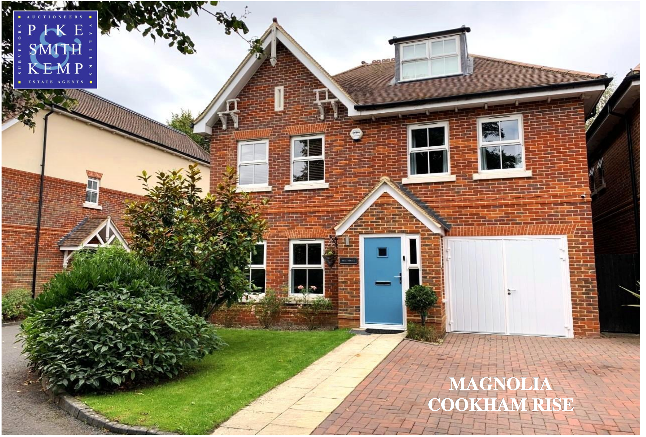
MAGNOLIA COOKHAM RISE

■ AUCTIONEERS ■ P I K E S M I T H K E M P ■ ESTATE AGENTS ■