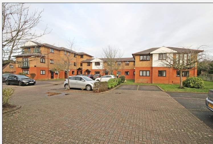
9 Sherbourne Court Maidenhead Price £260,000 Leasehold