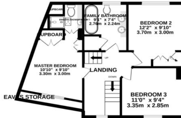
1ST FLOOR 539 sq.ft. (50.1 sq.m.) approx.