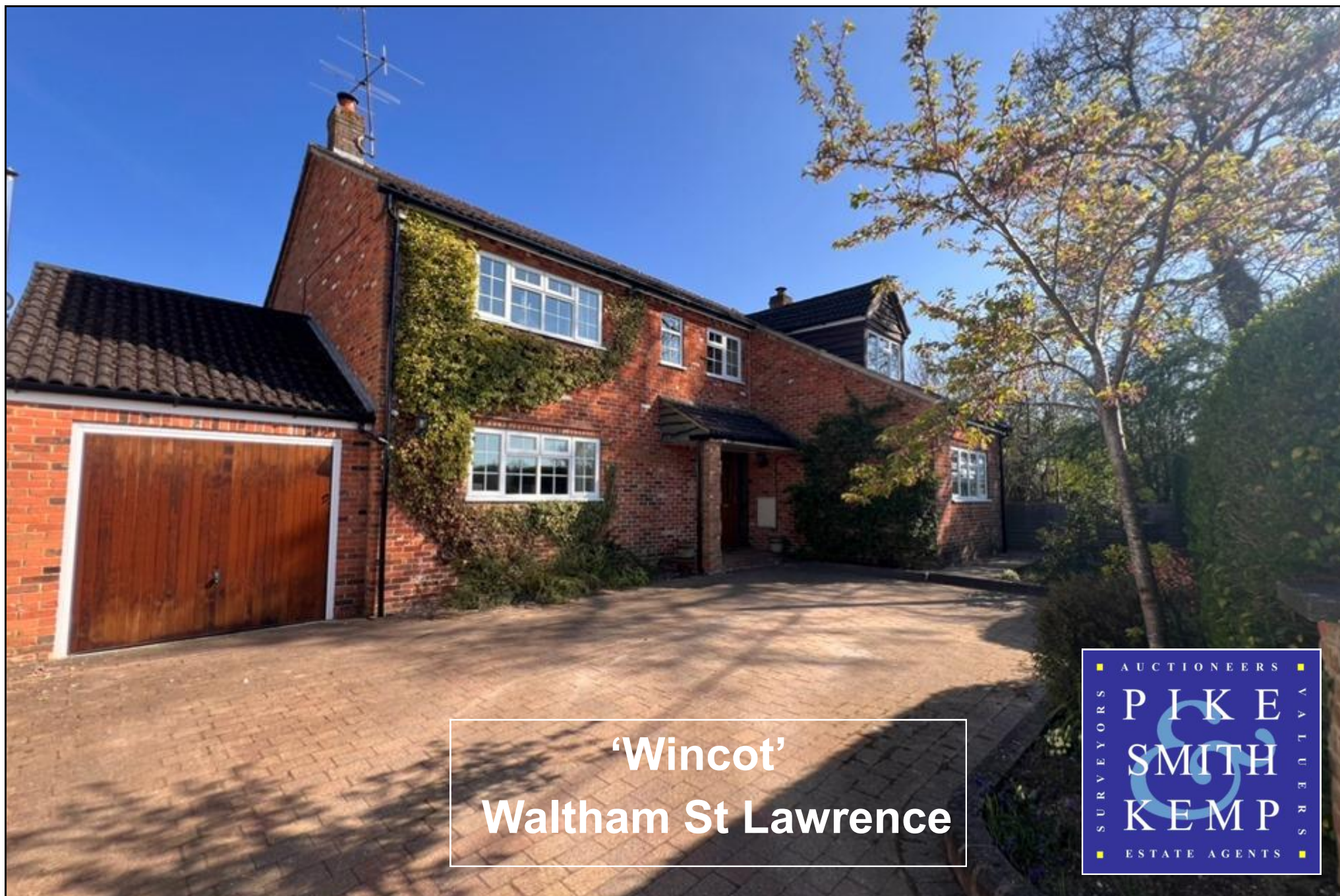
‘Wincot’ Waltham St Lawrence