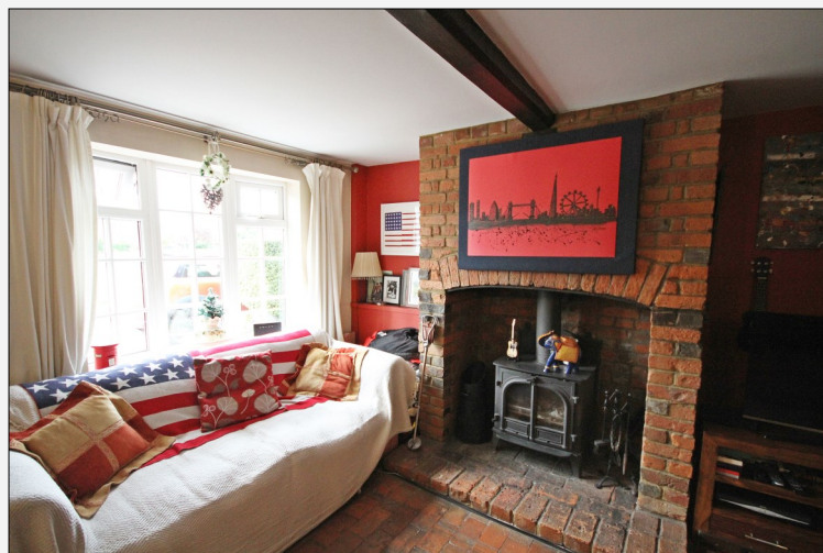
Honeysuckle Cottage Littlewick Green Guide Price £375,000 Freehold