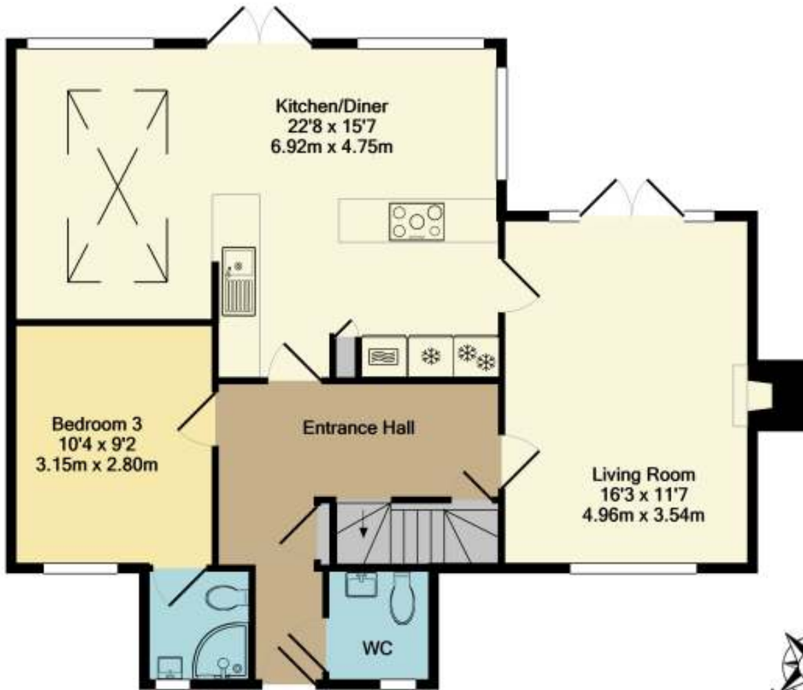
GROUND FLOOR APPROX. FLOOR AREA 818 SQ.FT. (76.0 SQ.M.)