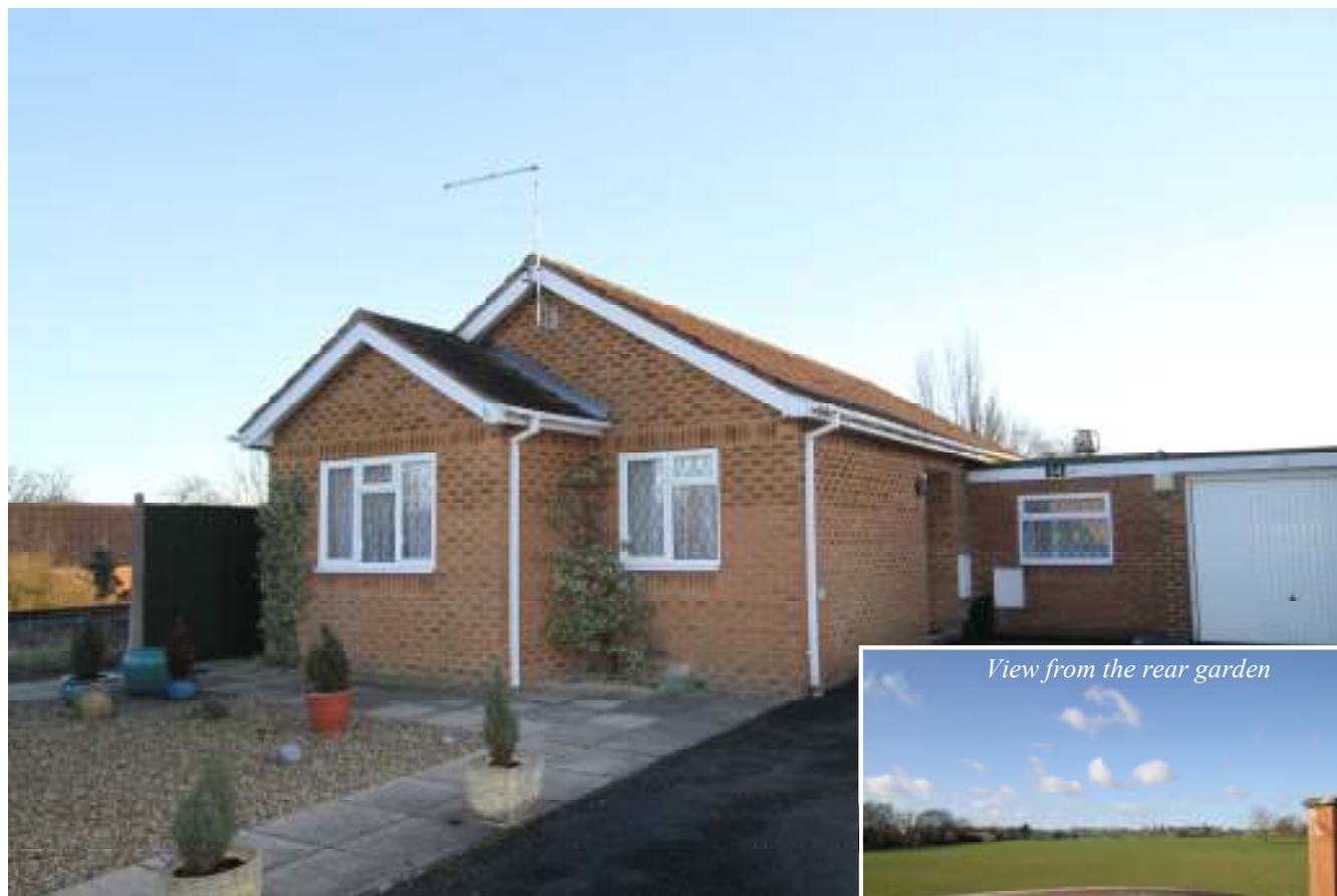
View from the rear garden