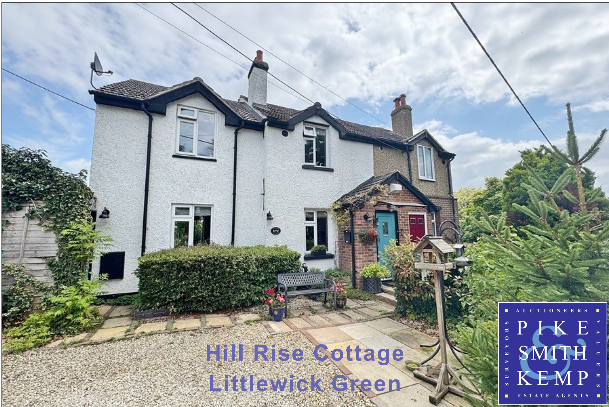
Hill Rise Cottage Littlewick Green