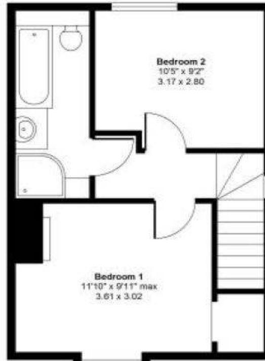
First Floor Approx 345 sq ft - 32 sq m (gross internal)