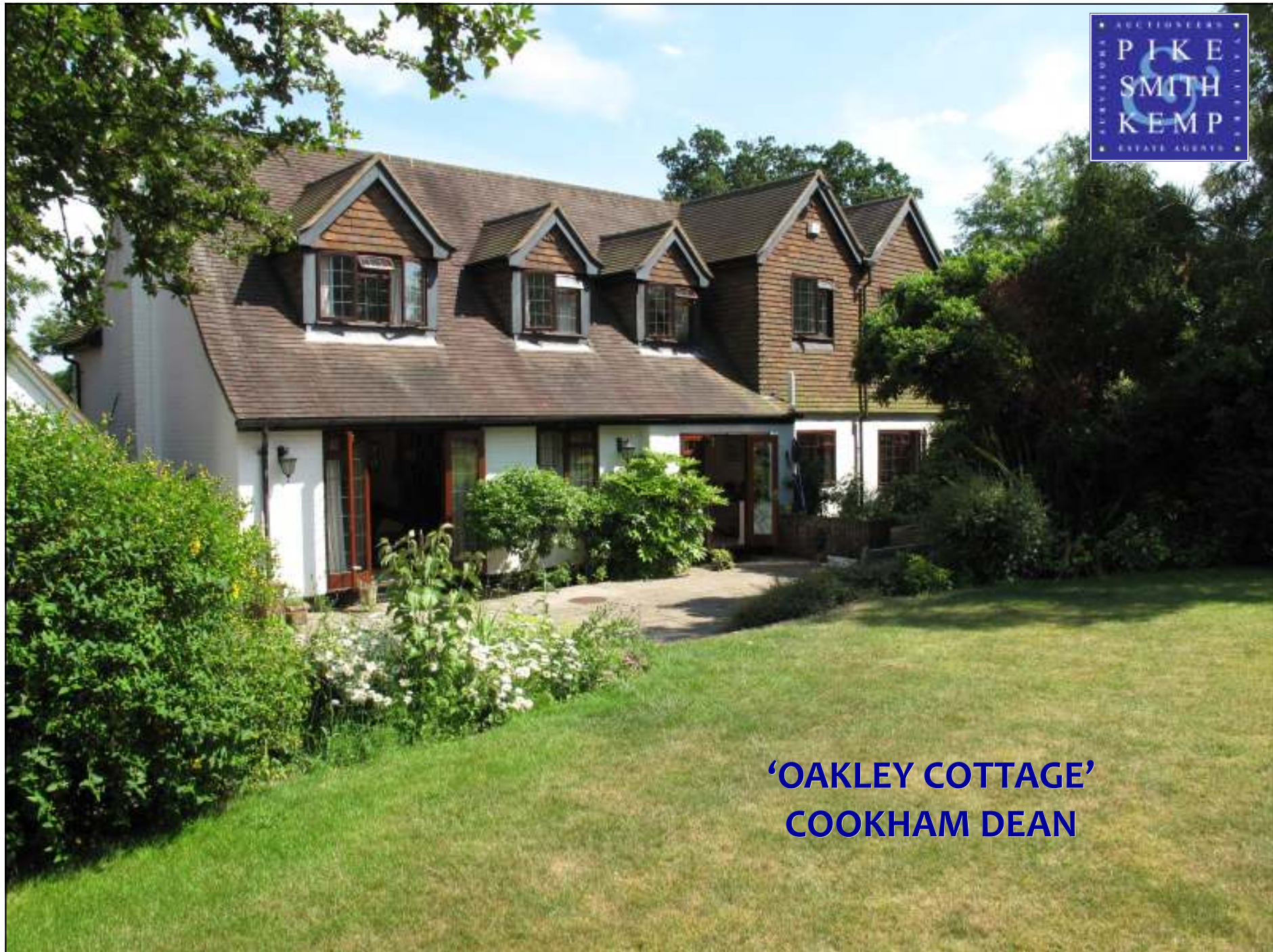
‘OAKLEY COTTAGE’ COOKHAM DEAN