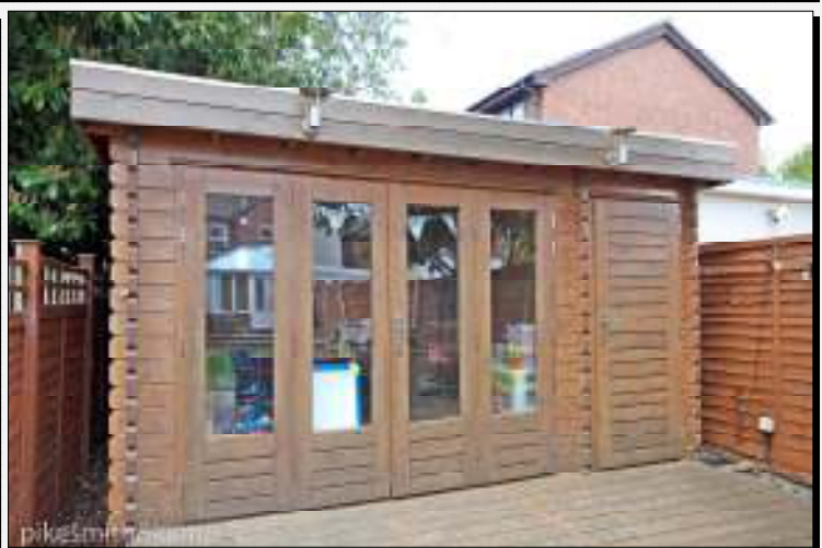
89 Blackamoor Lane, Maidenhead, SL6 8JR Guide Price £512,500 Freehold