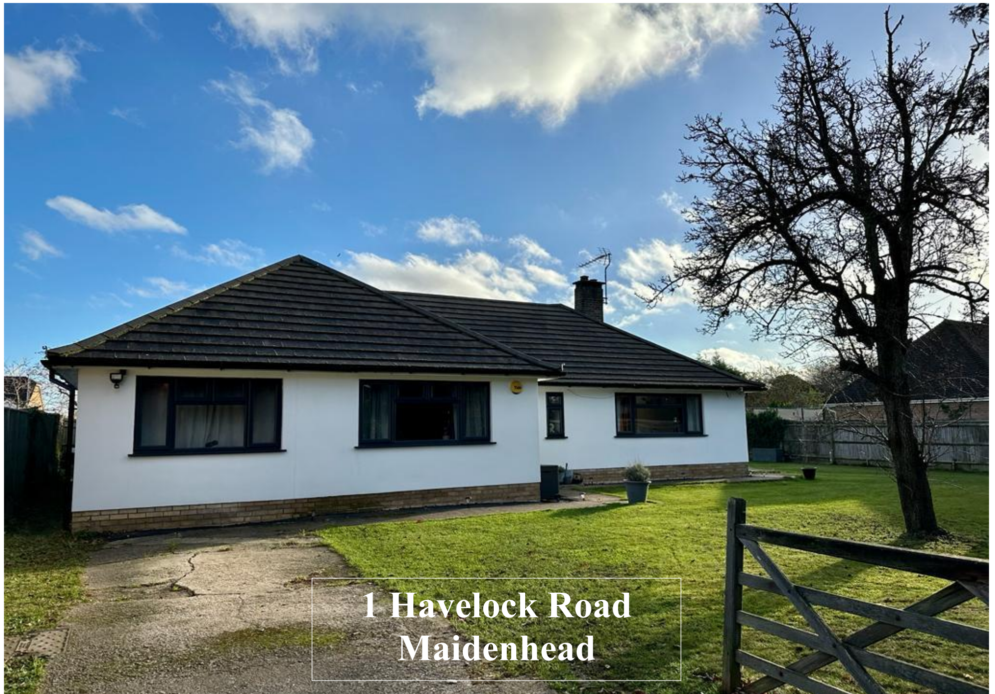
1 Havelock Road Maidenhead