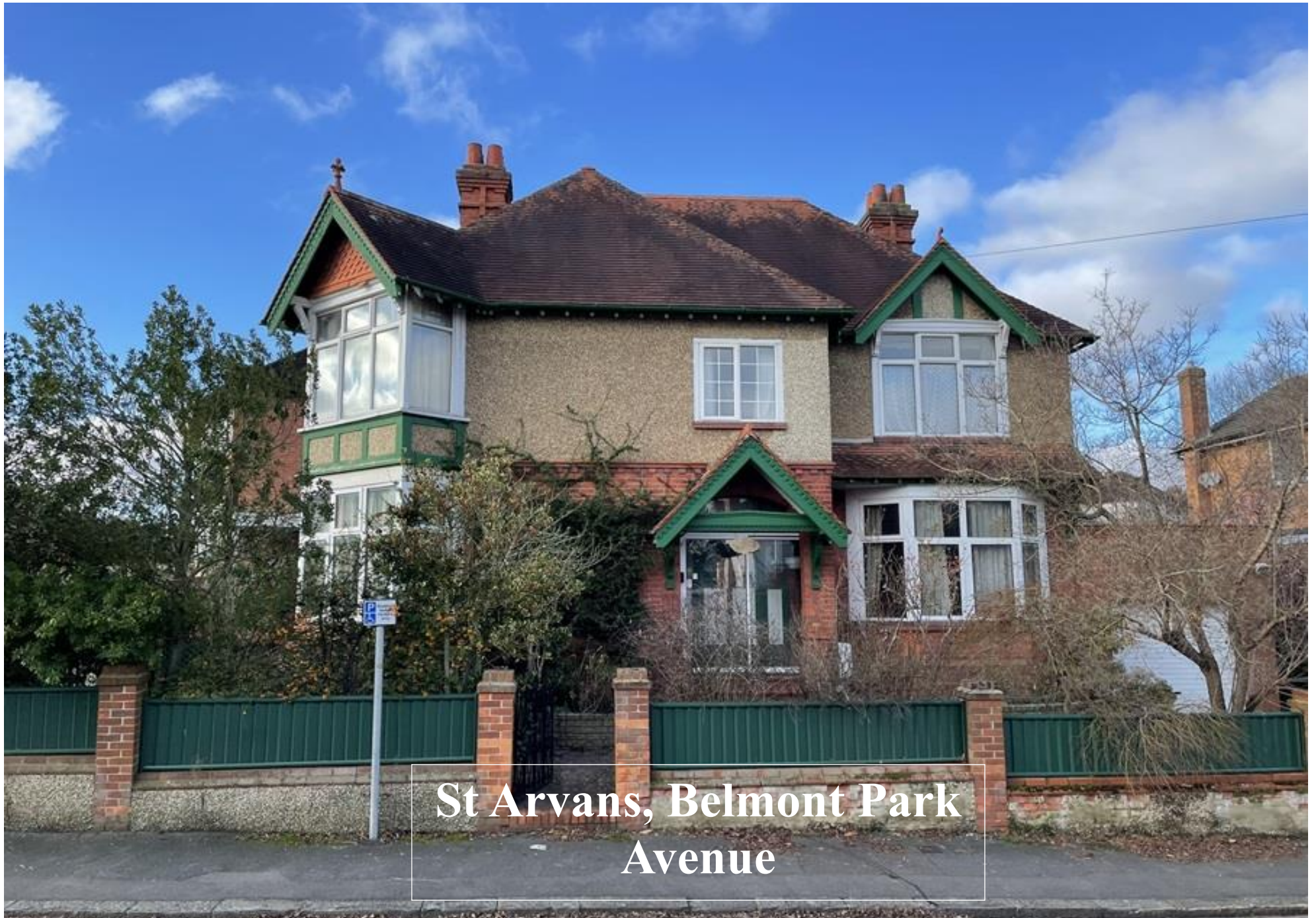
St Arvans, Belmont Park Avenue